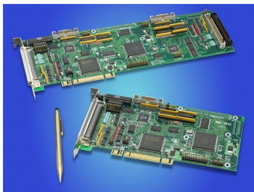
Default 1-4 axes model (bottom), default 5-8 axes model (top)